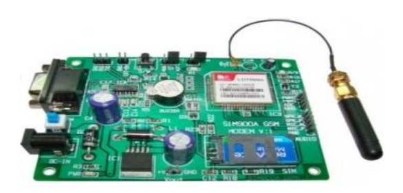
Fig 4: GSM Module SIM900A