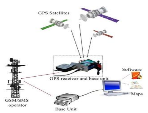
Fig 3: GPS Working

GSM Module SIM900A: The GSM guard by means of Microcontroller is used to ship or receive messages and make or receive calls identical to a cellular-cellphone via making use of a SIM card of any network provider. We can do that with the aid of plugging the GSM defend into the given Microcontroller board and then plugging in a SIM card from any operator that presents the GPRS insurance policy. The defend employs using a radio modem by the corporation, SIM Comm. We can keep in touch readily with the safeguard utilizing the commands. The GSM library involves the various methods of communication with the defend. This GSM Modem can then work with any GSM community operator SIM card identical to an traditional mobile mobile with its own 10 digit distinct telephone quantity. The skills of using modem is that its RS232 port can be used to interconnect and boost quite a lot of embedded functions.