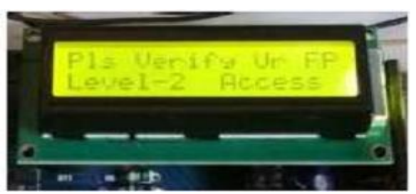
Fig 5: Level 1 Authentication

Level 1: At stage 1 finger print verification of user is finished. If finger print matched automobile door opened. Then the approach goes to the subsequent safety stage.